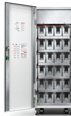
Modular battery cabinet for extended runtime requirements