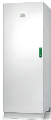
Empty battery cabinet for battery installation on-site