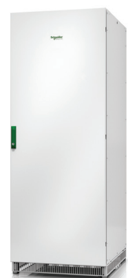
Classic battery cabinet with factory installed long-life batteries, for quick and easy installation on-site