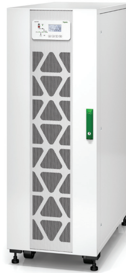
40 kVA Easy UPS 3S UPS with internal batteries