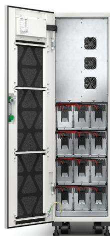
10 kVA Easy UPS 3S with internal batteries