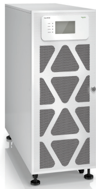
100 kVA Easy UPS 3M for external batteries