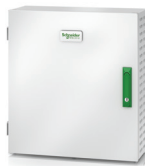
Parallel maintenance bypass panel